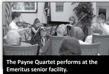
The Payne Quartet performs at the Emeritus senior facility.