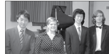
2012 YAC Winners

Contestants must be 18 and younger and come from Fredericksburg and the surrounding counties of Stafford, Spotsylvania, King George, Caroline, Culpeper, Orange, and Westmoreland.