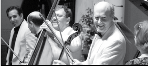
The Muir String Quartet and Guests perform at the 2012's 25th Annual Chamber Music Festival.