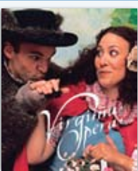
VA Opera: Little Red Riding Hood April 2-5, 2012